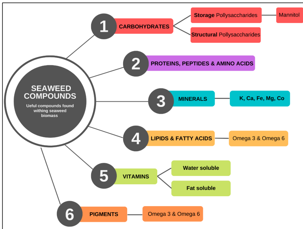
Figure 2: Categories of useful compounds found within seaweed.