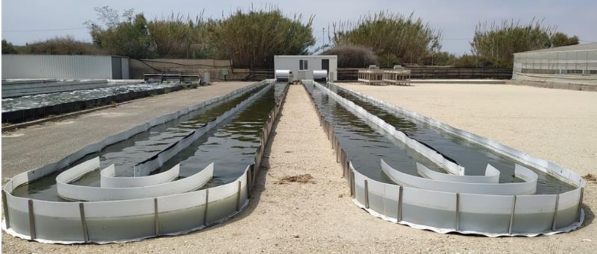
Figure 1. Raceway reactors located in IFAPA and University of Almería facilities.

of these systems. Moreover, modelling the microbial interactions that appear in microalgae-based wastewater treatment is mandatory for the improvement and stability of the microalgae-bacteria-based process performances. In this sense, The University of Almeria will provide samples from real production systems already in operation in the facilities located in Almeria (Spain) and will share knowledge about data already being obtained from these reactors in two additional EU projects named PRODIGIO and DIGITALGAESATION (Figure 1).